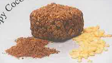
Crispy Cocoa Bars

Spray a large bowl with Vegalene® pan spray and mix graham cracker, crispy rice, and marshmallows. Mix in MallowCreme® until evenly incorporated. Finally, fold in chocolate chips and mix thoroughly. Spray a baking sheet with Vegalene® and pour mixture onto pan and spread evenly. Let cool for 2 hours before cutting.