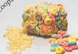
Froot Loops® Bars